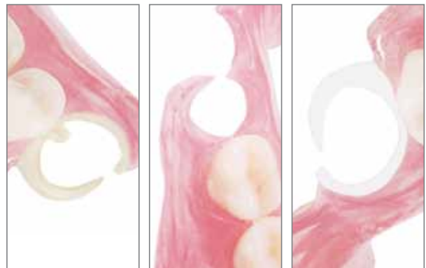
Thermoflex™ Tooth Shaded Clasp

Lucitone FRS flexible partials offer a range of shades to customize the clasps. Dentists and patients can choose between pink to blend in with the gingival, clear, or tooth shades.*