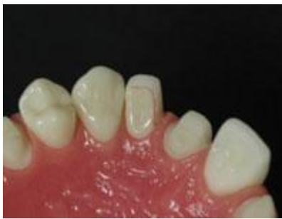
Figure 17. Diastema closure: lingual view of laminate veneer preparation on right lateral incisor showing desired extension of the lingual margin through the interproximal. The interproximal margin is placed slightly below the tissue.

Crowns, if fabricated over the preparations as originally cut, would have been bulky, unaesthetic, and prone to premature fracture. If this doctor had refused to re-prepare according to all-ceramic guidelines, then a PFM would have been recommended.