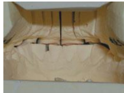
Figure 15. The same case as Figure 14 viewed from the lingual, showing the measured clearance at 0.1 to 0.3 mm. The doctor was informed, and reduction of the opposing mandibular anteriors was requested. This was strongly discouraged by the dental technician due to the amount of reduction needed.

Posterior teeth also require uniform, multi-plane reduction of the occlusal, lingual, and buccal aspects so the technician can build natural anatomic contours with optimal aesthetics (Figure 16). Once again, the use of depth cuts on the buccal, lingual, and occlusal aspects is helpful in keeping reduction oriented in the various natural anatomic planes.