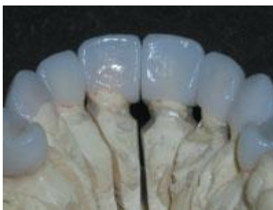
Figure 20. The lingual view shows the unnatural contours that the technician had to create due to the location of the final lingual and interproximal margins.