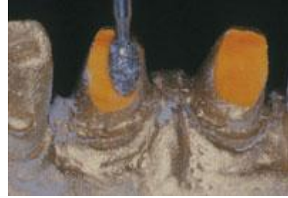
Figure 13. With the doctor's permission, the dies were revised in the laboratory before sending them back as a guide for a patient re-prep using the same 379-023 football diamond (Brasseler).

Reduction (sometimes major) of the incisal edges of opposing mandibular teeth is done far too frequently to "make room" for the lack of maxillary anatomic lingual reduction. If the proper anterior coupling cannot be accomplished with anatomic reduction of the maxillary teeth alone, then one should consider other alternatives, such as an appropriate opening of the occlusal vertical dimension (Figures 14 and 15). This often involves having an understanding of comprehensive, interdisciplinary restorative dentistry.