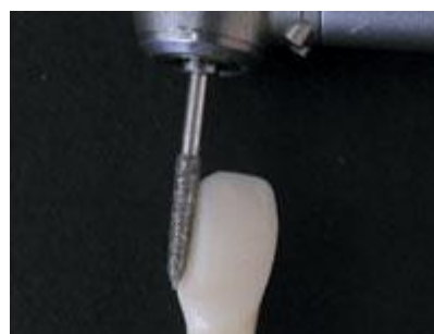
Figure 4. The 30006 chamfer bur (Brasseler) eliminates the J margin by incorporating a nonabrasive center pin.

(4) Incomplete and/or nonuniform shoulder (Figure 5): This problem causes the porcelain in the cervical areas to vary significantly in thickness, with a potential for premature fracture during fabrication, in the process of seating, or after cementation. There can also be potential aesthetic problems when-ever there are varying porcelain thicknesses. When pressed ceramics are being prescribed such as IPS Empress (Ivoclar Vivadent), IPS Empress Esthetic (Ivoclar Vivadent), IPS Eris (Ivoclar Viva-dent), Authentic (MicroStar), OPC (Pentron Laboratory Technologies), OPC Plus (Pentron Laboratory Technologies), OPC 3G (Pentron Laboratory Technologies), Cerapress (Vident), etc, be sure to maximize strength and aesthetics by preparing a complete, uniform, 360 degrees, 1- to 1.5-mm shoulder (butt-joint margin). An 846KR or 847KR diamond is an example of an appropriate shoulder bur to use (Brasseler, SS White, Axis).