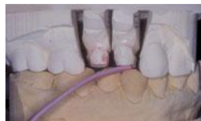
Figures 8 and 9. Compare these 2 photos. Figure 8 shows all-ceramic posterior preparations with what looks like "plenty of room." In Figure 9, a 1-mm Flexible Clearance Tab verifies that the occlusal reduction is far short of the 2 mm recommended for posterior all-ceramic crowns.

(9) Lack of uniform, anatomic reduction: This is a challenge in the application of all-ceramic restorations for all areas and surfaces of the dentition, not just the facial aspects of anterior teeth. Again, over- and under-reduction can often be observed on the same preparation. How do we prevent this problem? Uniform, multiplane reduction needs to be done thoughtfully so that the dental technician can replace the missing tooth structure with uniform layers of aesthetic porcelain. Depth cuts are strongly recommended to stay properly oriented in space, even for the most experienced doctors (Figures 10 and 11).