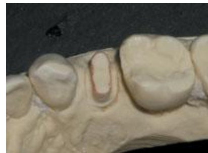
Figure 1. An otherwise nicely done all-ceramic preparation with sharp line angles circumferentially on the occlusal aspect.

(1) Sharp line angles: Sharp line angles can cause minor to major fit problems, all resulting in more time-consuming seating appointments (Figure 1). This is true for any type of restoration, not just all-ceramics. A premature stress fracture occurring at the seating appointment, or worse yet, some time after cementation, can be the costly result of leaving sharp line angles under an all-ceramic or indirect composite restoration. These issues can also cause an erosion of confidence between the doctor, staff, and/or patient. The solution in this case is simple. It is usually just a matter of remembering to round all sharp line angles after the rest of the preparation is completed. Use any tapered, fine diamond bur to perform this important procedure. A 7856-014 (Brasseler, SS White, Axis) would be an example of an appropriate bur to use.