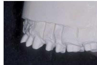
Figures 10 and 11. Compare these 2 photos and observe the relative axial inclination of the anterior teeth. This will present a severe structural and aesthetic dilemma for the dental technician who must try to accomplish the end result as outlined in the model of the diagnostic wax-up in Figure 10, utilizing the preparations in Figure 11.

One of the most critical yet overlooked areas to reduce anatomically is the lingual of anterior teeth. Specifically, more attention to the lingual anatomic reduction of maxillary anterior teeth is needed. One bur that can be used to create lingual anatomic reduction is the 379 football diamond (Brasseler, SS White, Axis, Figures 12 and 13). This allows the dental technician to restore proper anatomic form and achieve proper occlusal coupling that will include stable, holding contacts in class I occlusions. The resultant effects of bulky, over-contoured crowns on muscular harmony, force management, long-term wear patterns, and joint health are significant and have been well documented. 3