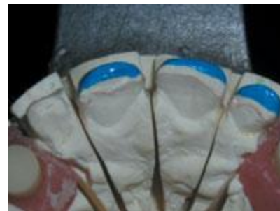
Figure 2. Long bevels were inappropriately cut on the lingual surfaces of these laminate veneer preparations.

With laminate veneers, long bevels placed on the lingual surfaces are not acceptable (Figure 2). Instead, a butt-joint margin is preferred for incisal edge reduction. A chamfered lingual wrap may be used occasionally to satisfy certain unique functional or aesthetic circumstances. This is typically reserved for cases in which it may be advantageous to have tooth structure internally supporting or showing through the porcelain. Chamfer burs such as the 856 (Brasseler, SS White, Axis), or shoulder burs such as the 846KR or 847KR (Brasseler, SS White, Axis), can be used to prepare all-ceramic margins successfully without bevels.