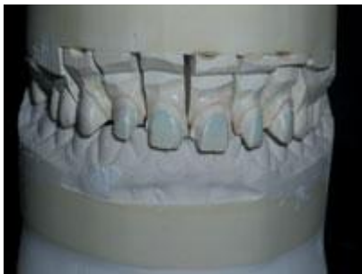
Figure 14. A case involving all-ceramic crowns.

Reduction (sometimes major) of the incisal edges of opposing mandibular teeth is done far too frequently to "make room" for the lack of maxillary anatomic lingual reduction. If the proper anterior coupling cannot be accomplished with anatomic reduction of the maxillary teeth alone, then one should consider other alternatives, such as an appropriate opening of the occlusal vertical dimension (Figures 14 and 15). This often involves having an understanding of comprehensive, interdisciplinary restorative dentistry.