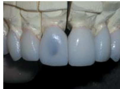
Figure 19. The facial view appears as if it will be aesthetically pleasing. (The die has also been blackened to help illustrate a potential aesthetic dilemma on the right central incisor. Depending on the underlying stump shade, failing to reduce in multiplanes will result in nonuniform porcelain coverage causing an aesthetic