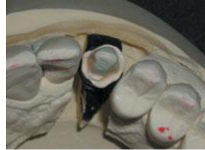
Figure 5. A shoulder that needs revision to establish uniform width and eliminate roughness.

(5) Rough shoulder (Figure 5): Much like taking a little extra time to go back and round any sharp line angles, a minor effort here will pay big dividends. A smooth shoulder will help to ensure an excellent fit, a minimal cement line, and improved aesthetics at the margin. It can also translate into a reduction in the potential for stress fractures at the seat or a delayed fracture after bonding the crown in place. After the shoulder is prepared with a shoulder bur such as the 846KR or 847 KR (Brasseler, SS White, Axis), go back with an appropriately sized 10839 (Brasseler) end-cutting bur and refine the shoulder. With this bur, it can be done quickly and safely without any further undesired removal of axial tooth structure.