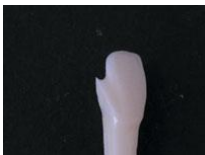
Figure 3. A J margin is created when the apex of the chamfer bur passes the edge of the margin, creating a groove.

One of the dangers in preparing a definitive chamfer margin is the unintended creation of a J (or grooved) margin. This occurs when the apex of the diamond passes the edge of the margin and creates a groove inside the margin (Figure 3). If the coping fabrication technique requires scanning, it can lead to inaccuracy in the scan, resulting in a poor fit at the margin. Possible physical degradation of the die during handling and certain scanning procedures as well as thin porcelain created on this fragile margin makes a J margin unacceptable. If you use an 856 series chamfer diamond to prepare the margin, one must exercise caution not to exceed a depth into the tooth equal to one half of the width of the bur tip. This means an appropriate diameter bur must be selected to create the chamfer depth desired. Another potential solution to prevent this problem is to try a 30006 bur (Brasseler) that has a safe-sided center pin in the tip. This center pin helps to limit the depth the bur can cut into the tooth, thus reducing the chance for the creation of a J margin (Figure 4). If you wish to correct a J margin that has been accidentally created, it can be converted into a modified shoulder margin by reducing the outer lip with a 10839 end-cutting porcelain bur (Brasseler).