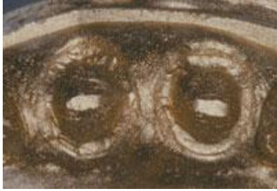
Figure 12. Maxillary anterior central incisors prepped for all-ceramic crowns. (Gold dust painted on to visualize better the teepee shape that does not reflect anatomic lingual contour.)