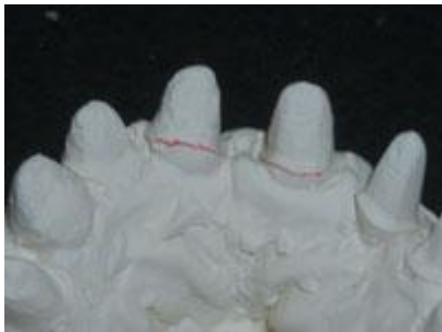
Figure 18. Note the attempt to save a small portion of the cingulum areas on these maxillary central incisors.

Lingual cervical margin placement with full crown coverage is also important when closing diastemas. While it is always prudent to be conservative whenever possible, some-times in that same effort we can create contours that may be aesthetic from an anterior viewpoint but lack natural, hygienic form from another perspective (Figures 18 to 20).