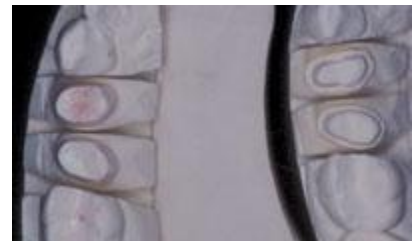
Figure 16. This is the same all-ceramic case seen in Figures 8 and 9. On the left is the original solid pour model. On the right is a revised solid pour model sent back by request to the doctor for re-prep. Note changes in shoulder width and overall reduction.

Posterior teeth also require uniform, multi-plane reduction of the occlusal, lingual, and buccal aspects so the technician can build natural anatomic contours with optimal aesthetics (Figure 16). Once again, the use of depth cuts on the buccal, lingual, and occlusal aspects is helpful in keeping reduction oriented in the various natural anatomic planes.