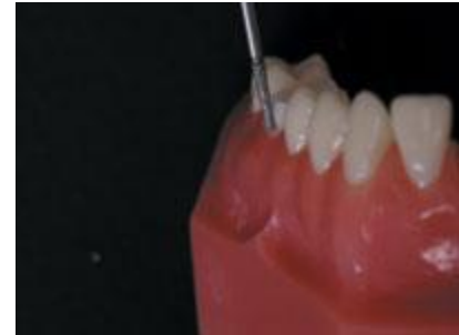
Figure 6. The usable width of a shoulder is reduced by tipping in the bur too far at the margin, creating an undercut.

(7) The "pseudo-shoulder": This dilemma occurs when we lose orientation to the proper planes of reduction and angle the tip of the bur too deeply into the margin (Figure 6). The end result is a shoulder that may at first appear to be wide enough, but in fact if surveyed for undercuts, is really not. This can reduce the strength of the porcelain at the margin and can diminish the desired aesthetics for the cervical one third of the restoration. Ideally, one should consider using depth cuts to stay oriented in space. This will prevent cutting into the shoulder area at an angle that creates an undercut area which, once blocked out, reduces the effective shoulder width for the dental technician.